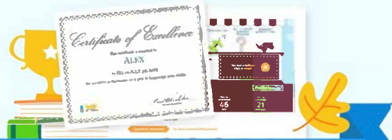
Certificates and awards