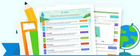
Unlimited practice in 8,000+ skills

We're using IXL to support our curriculum this year, and your child has access to this online program at home. With thousands of skills that match what we're learning, as well as insights into student progress, IXL is a great resource to help your child excel.